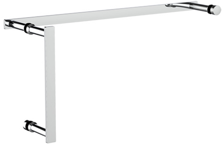
Offset Door Handle Shown with a small Rosette