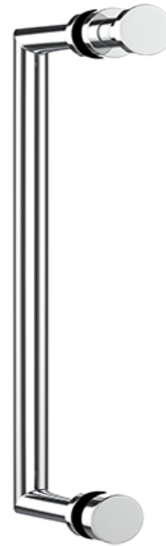
Single Door Handle with Knob shown with a medium Rosette