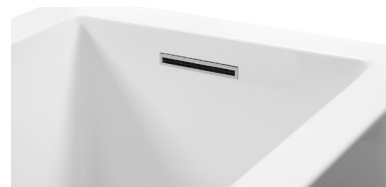
Optional Slim-Line overflow