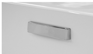
Rectangular overflow included

Slim-Line Overflow with Toe Tap Drain Solid Brass Drain Chrome (SLOTSBC) $930 Brushed Nickel (SLOTSBBN) $935 Polished Nickel (SLOTSBPN) $935 White (SLOTSBW) $965