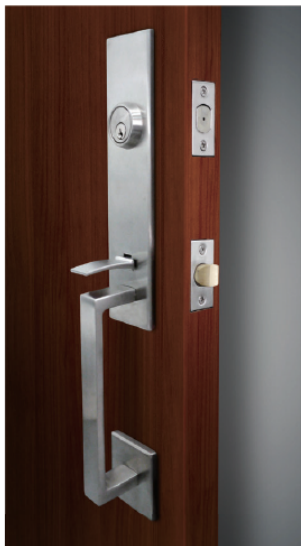
MH (Manhattan Tubular)