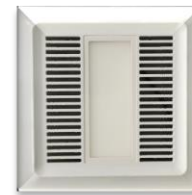
L1 (W) Grille

ETL/cETL Listed for installation over tub/shower enclosure when used with GFCI circuit wiring